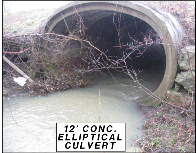
12' CONC. ELLIPTICAL CULVERT