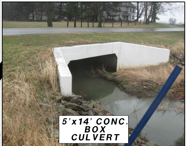
5'x14' CONC. BOX CULVERT